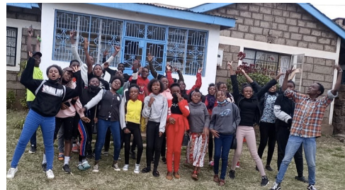
Core Group Machakos