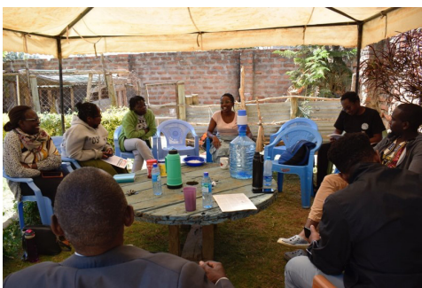
Kitui Mission Trip