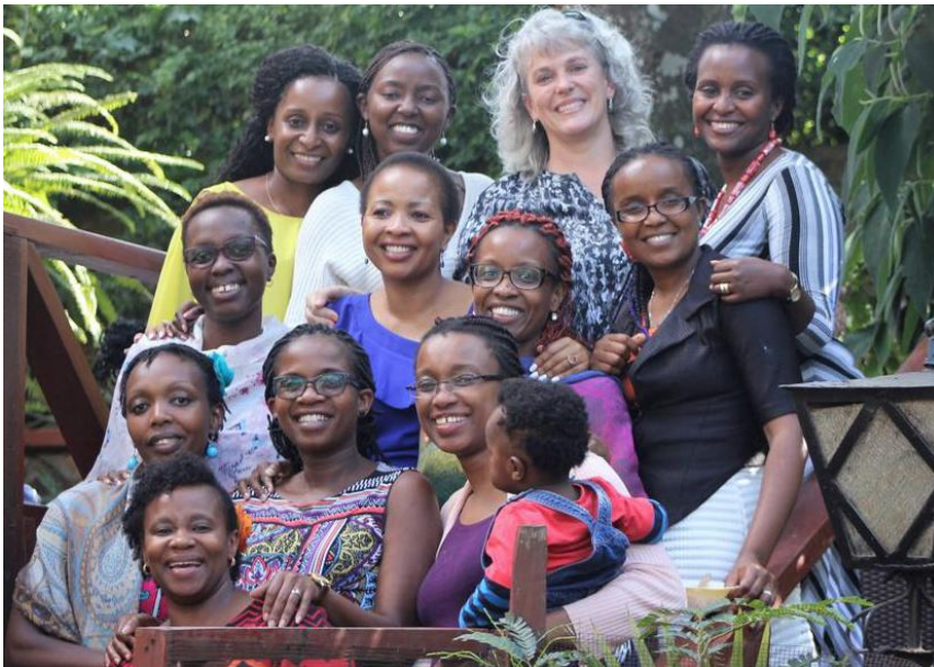
The Praying Moms Group