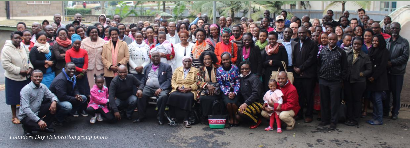
Founders Day Celebration group photo